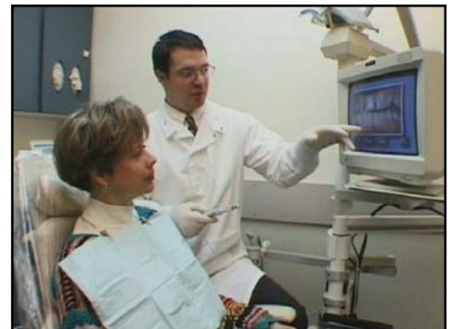
A clear understanding

The intraoral camera allows you to be an active partner in your dental treatment by enabling you to see what we see inside your mouth. With a clear understanding of your dental conditions, you'll be able to make treatment decisions with confidence.